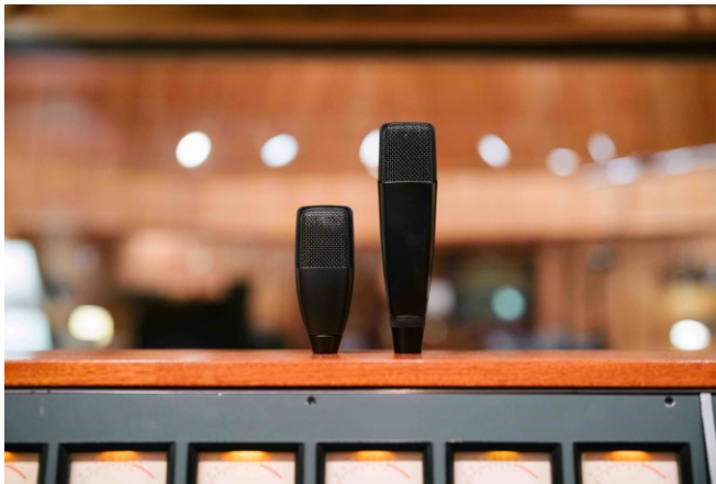
The large-diaphragm MD 421 Kompakt offers the same legendary sound as the MD 421-II (right)