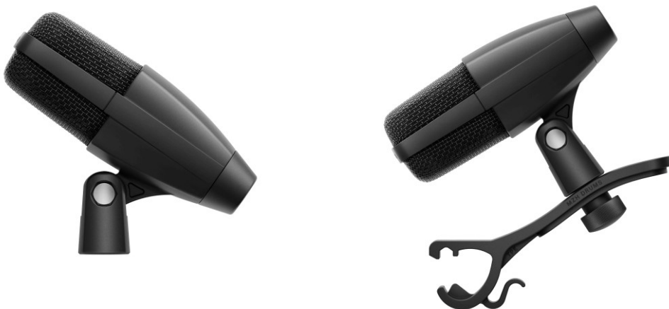
The MD 421 Kompakt (left) and the MD 421 Kompakt for Drums, which comes with additional MZH drum clamp

Wedemark, 1 October 2024 – They say that if you’ve heard music, you are most likely to have heard the MD 421, a Sennheiser microphone featured in countless award-winning performances and productions over the past six decades. Now Sennheiser launches the MD 421 Kompakt, an incredibly versatile microphone that delivers the same legendary performance, but in a truly multipurpose package — including a completely redesigned mounting clip. The MD 421 Kompakt features a cardioid pick-up pattern and remarkable dynamic range, delivering crystal-clear sound reproduction in live sound and recording applications.